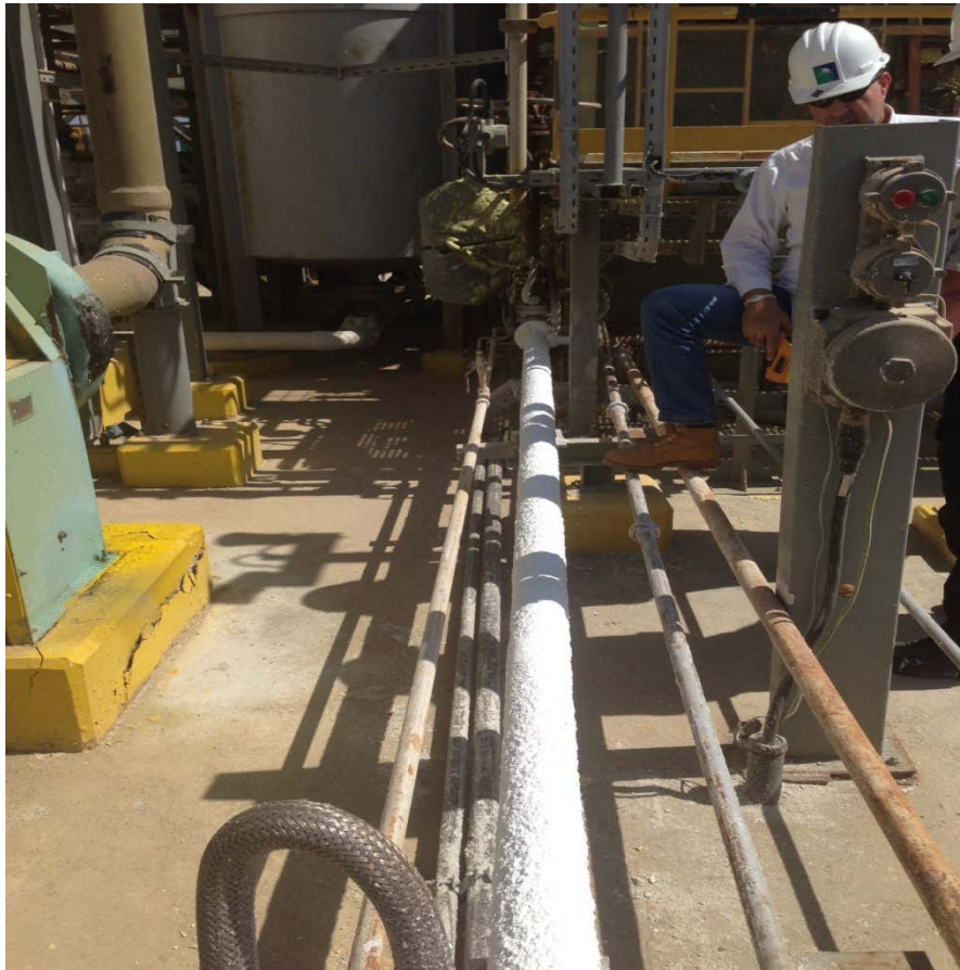
Bare Pipe Temp: 147 C